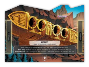
1 Ark Tile